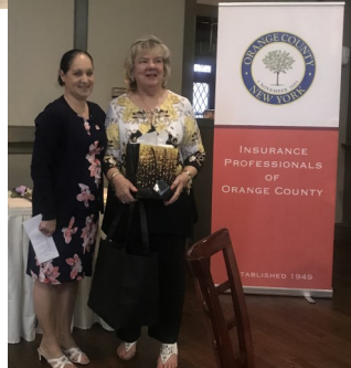
Installation Dinner for IPALI