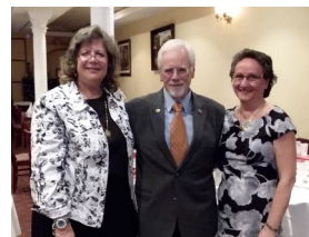
Installation Dinner for Westchester Insurance Professionals