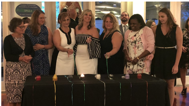
Installation Dinner for IPALI