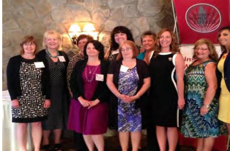
Insurance Women of Buffalo 2015 Board

President –Insurance Women of Buffalo 2015-2016